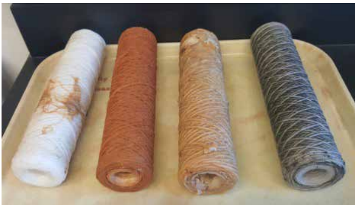
Picture 1: Various water filter with mineral and bacterial challenges.

Has it been more than 2-3 years since you checked the quality of the water your birds are consuming? Are you confident enough in your current water program to go to the end of the waterline and take a drink? Do your water filters become “dirty” each flock? Maybe they turn reddish/brownish, black, or grey? Does your water smell like rotten eggs? Do you have high mortality issues? Do you have performance issues? If you answered “yes” to any of these questions you could have a water quality issue affecting the performance of the birds. However, don’t assume if your water is clear that the water is acceptable. Water that looks clear can also have bacteria challenges, if not more, than discolored water.