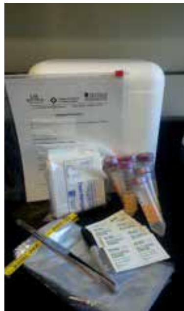
Picture 2: A water test kit that can be purchased through Watkins' Water Quality Laboratory. All the necessary supplies are included to properly take a water sample.

The Watkins Water Quality Lab within the Center of Excellence for Poultry Science at the Division of Agriculture within the University of Arkansas provides key testing for evaluating poultry farm water quality. This lab runs various microbial analysis including, an aerobic plate count (total bacteria count), yeast, mold, E. coli, and coliform test. Testing for aerobic or total bacteria, yeast and mold gives a general idea