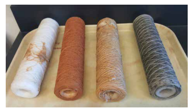
Picture 1: Various water filter with mineral and bacterial challenges.

Has it been more than 2-3 years since you checked the quality of the water your birds are consuming? Are you confident enough in your current water program to go to the end of the waterline and take a drink? Do your water filters become "dirty" each flock? Maybe they turn reddish/brownish, black, or grey? Does your water smell like rotten eggs? Do you have high mortality issues? Do you have performance issues? If you answered "yes" to any of these questions you could have a water quality issue affecting the performance of the birds. However, don't assume if your water is clear that the water is acceptable. Water that looks clear can also have bacteria challenges, if not more, than discolored water.